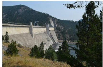
Libby Dam, Montana

Grants. One of the Foundation's long term strategies is to identify partners that we can assist in utilizing grant funding. As a direct result of discussions during the meeting, we were able to identify a partnering opportunity with the Corps at Libby Dam and later with Lake Ouachita. Encouraging them to apply for an Every Kid in a Park Transportation Grant, the applications for the National Park Foundation's grant have been submitted and we are hopeful they will be approved to fund transportation and education activities for 4th grade elementary students at Libby Dam and Lake Ouachita.