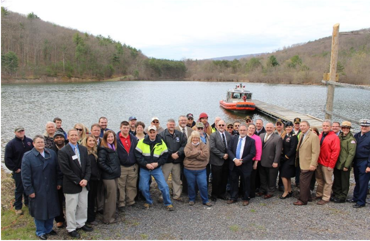
Photo of the 2015 EIP award ceremony held at Raystown Lake, PA.