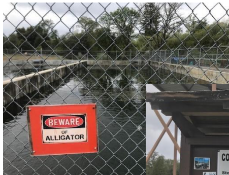
“Beware of Alligator” sign and fake alligators in water donated by UVFVC & enjoyed by the visitors

Bulletin Board with fresh new white board purchased by UVFVC