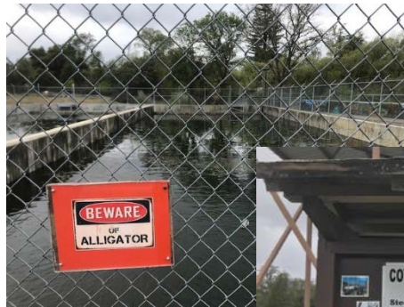
Bulletin Board with fresh new white board purchased by UVFVC