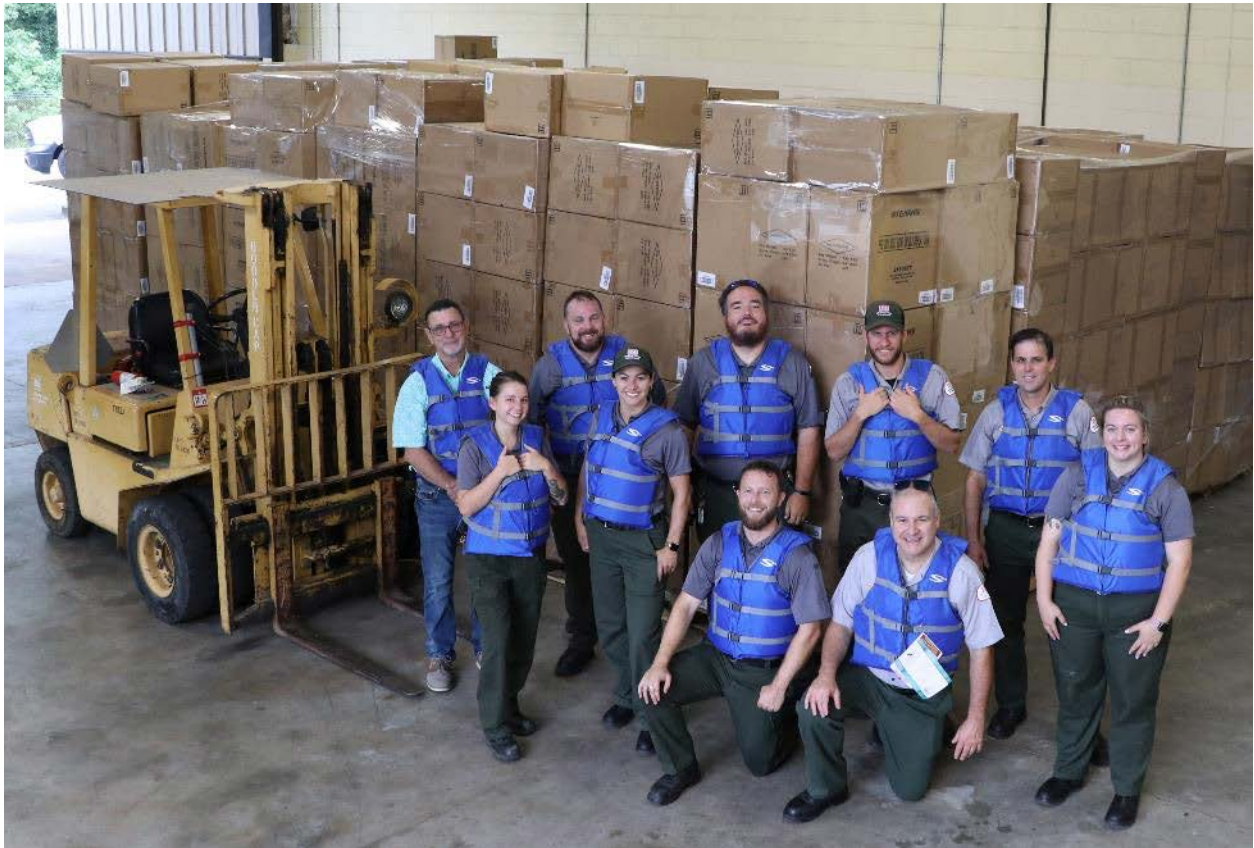
USACE staff at Allatoona Lake shown here with part of the shipment of donated life jackets.